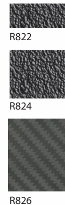
Shown at 12.5% scale.