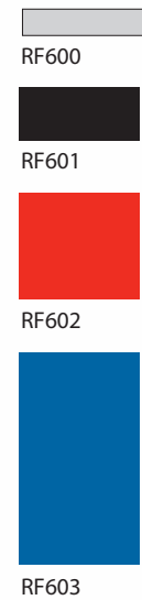
Configurations shown at 750% scale.